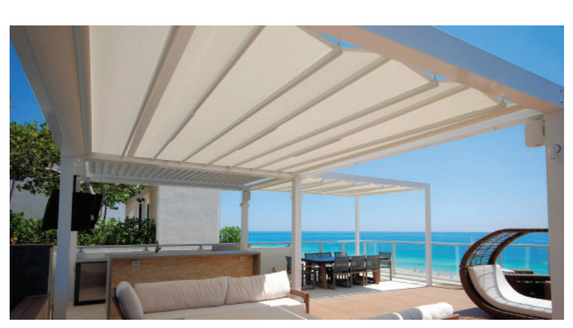
Taught canvas with spacers.