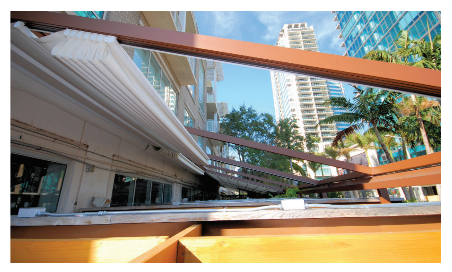
Pergotenda® Impact | Miami Awning, Miami FL