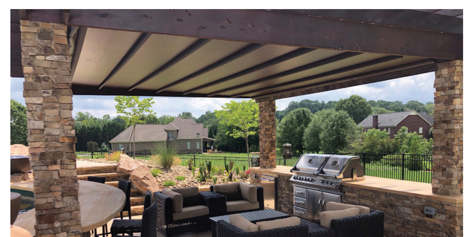
12 The Outdoor Alchemist