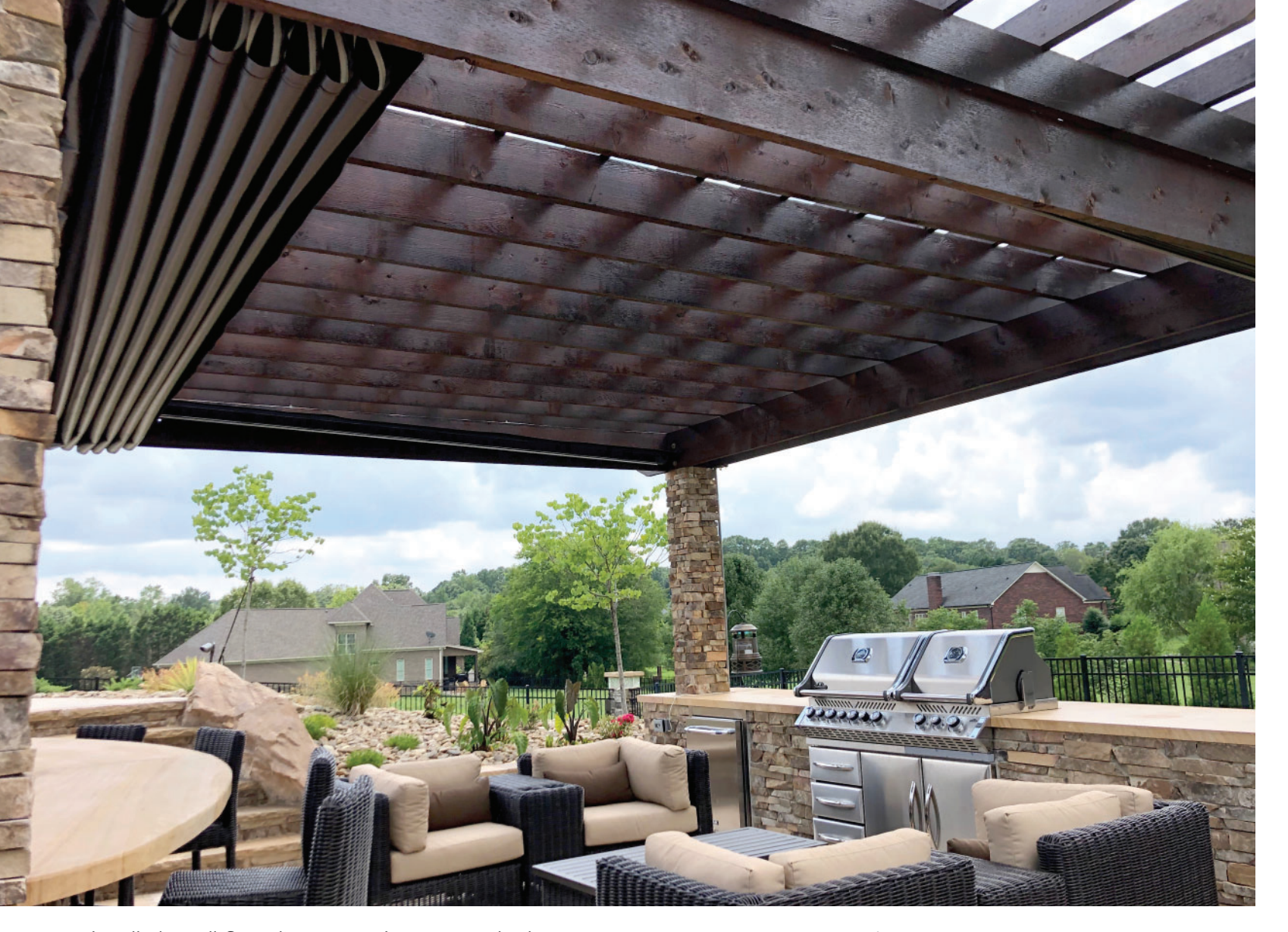
Installed on all Corradi structures, Impact can also be used with pre-existing pergolas or other structures.