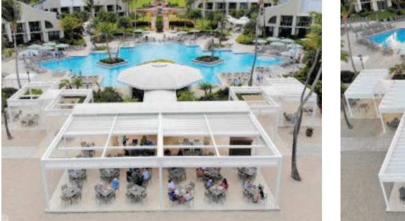
\mathsf{Pergotenda}^{\scriptscriptstyle \otimes} B-Space Wall-to-wall with custom frame | Miami Awning, Miami FL