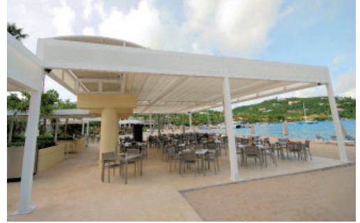
More space to offer