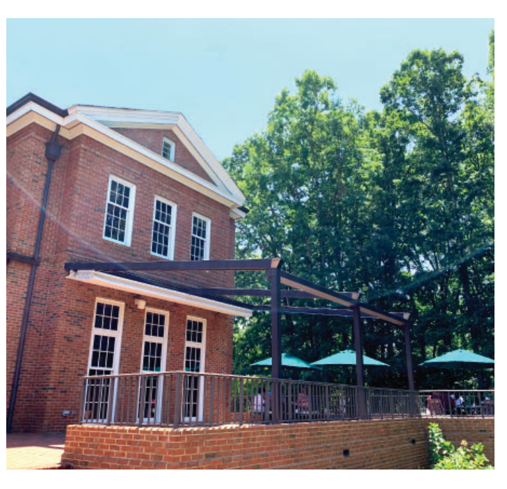
Pergotenda® B-Space | Charlotte Tent & Awning, Charlotte NC